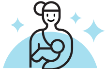
Infant Feeding Support