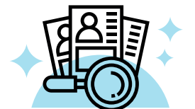
Employment & Training