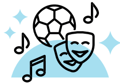
Out Of School Activities