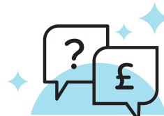
Benefits & Welfare Rights Advice