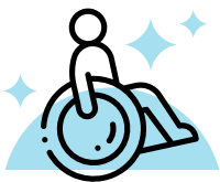
Special Educational Needs and/or Disabilities (SEND) Support