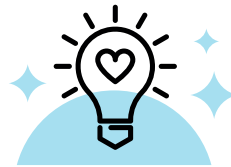
Emotional Health & Wellbeing