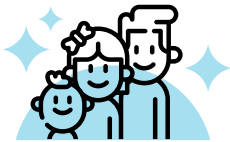
Midwives & Health Visitors

Services provided from within the Family Hub, include: